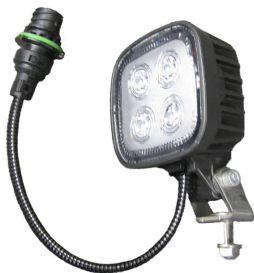
Work lamp with white LEDs.

The lens is bonded to the housing, which is completely waterproof and made of impact-, scratch- and corrosion-resistant black plastic. The lamp is operated via a flexible switch in the instrument panel. When the lamp is activated, the switch is illuminated by an amber LED light.