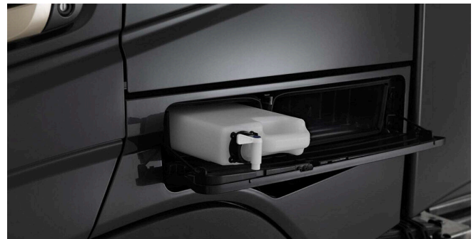
The freshwater tank is an accessory.