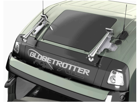
FH Extra High Sleeper Cab, HORN-R2S, UACCBRT.