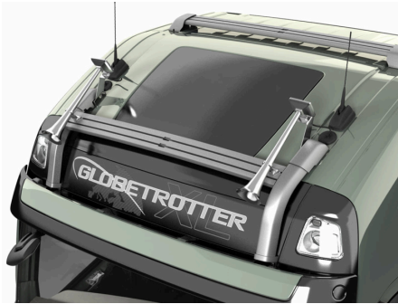
FH Extra High Sleeper Cab, HORN-R2S, ACCBR-F.