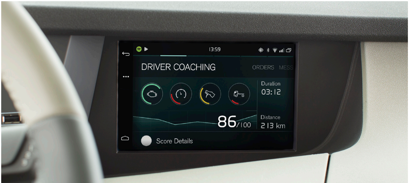
Driver Coaching in the integrated 7" colour display Volvo FH.

There is variety of different reports that can be customized for specific needs. The overview report covers fuel consumption, idling, coasting and usage of I-Shift, cruise control and much more for the vehicles and drivers.