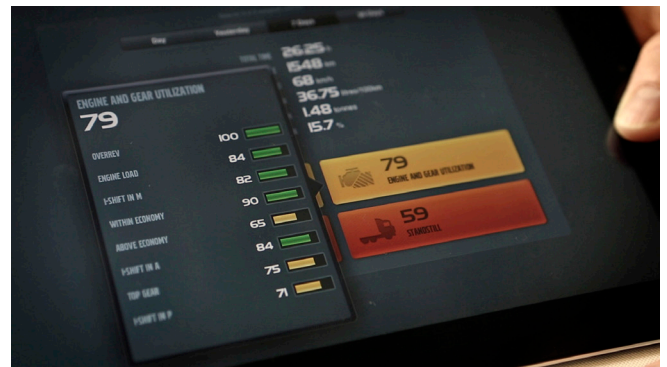
The Dynafleet App for quick and powerful follow up of driver performance.

The unique properties of the Fuel Efficiency Score enable immediate comparison of e.g. long haul and distribution applications.