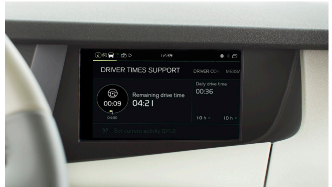
Driver Times Support in the integrated 7" colour display Volvo FH.

The Driver Times Support in the truck coaches the driver to comply with the driving and resting times legislation. It warns the driver to mitigate infringements and it also helps to plan weeks ahead. The Driver Times Support is available in Volvo FH, FM, FMX with MEDIADF or MEDIANDF , and the Tachograph 2.1 or later.