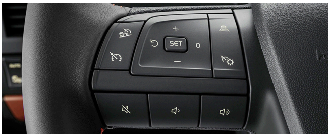
Activation and setting of speed is done by controls placed on the left side of the steering wheel.