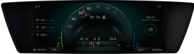
The cruise control activation is indicated in the driver information display.