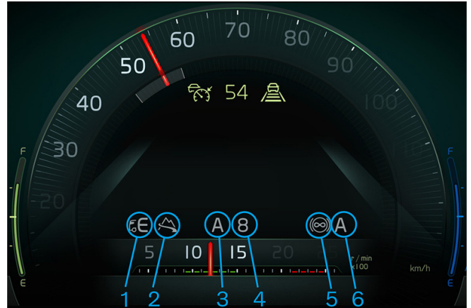
Shown on the display: 1. Drive mode 2. I-See symbol (Green = Working / Grey = Engaged "Ready to work") 3. Automatic gear shifts / Manual gear shifts 4. Selected gear 5. Aux Brakes engaged 6. Brake level in position automatic (A=Brake blend)

The I-Shift gearbox's functions are optimized with specially adapted drive modes, which make the gearbox even more practical and economical by adapting the gearshift functionality to the current transport conditions. For more information, see fact sheet "I-Shift drive modes and software functions".