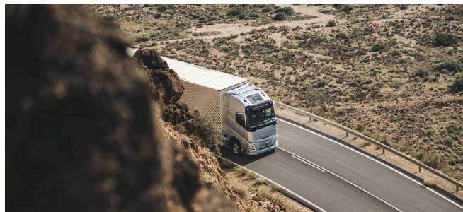
Air deflectors on the roof.

AIRFLOW Airflow Package including roof & side air deflectors and chassis fairings