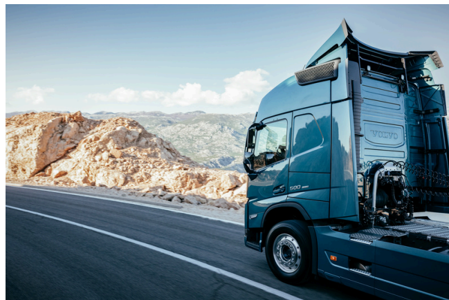
Air deflectors on the side.

The side air deflector hinge is opened towards the back of the cab. The distance between the back of the cab and the rearmost edge of the air deflector in the open position is approximately 180 mm.